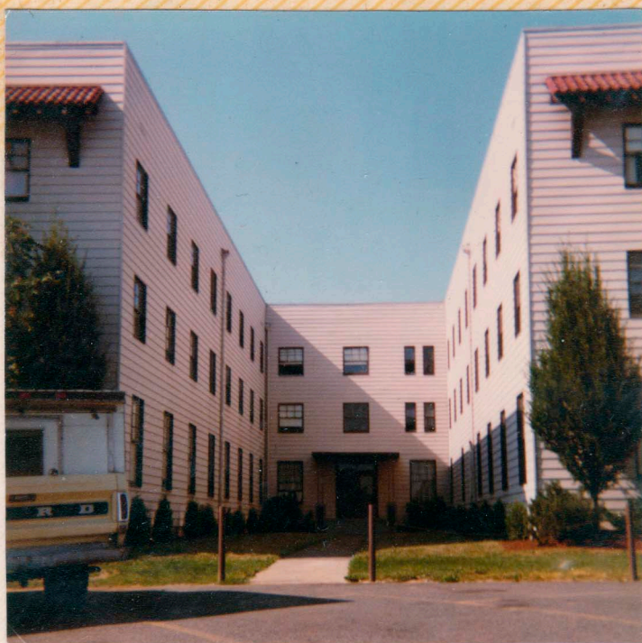
FRONT OF "VILLA WEST"