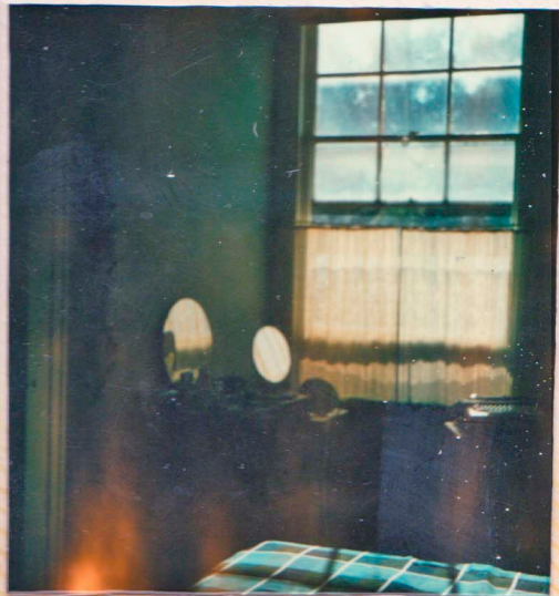
Bedroom MY ROOMS