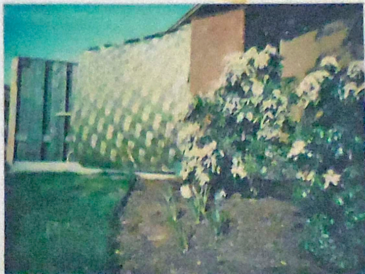
1979 - 3607 45th - Triplex - neighbor-blocking screen April