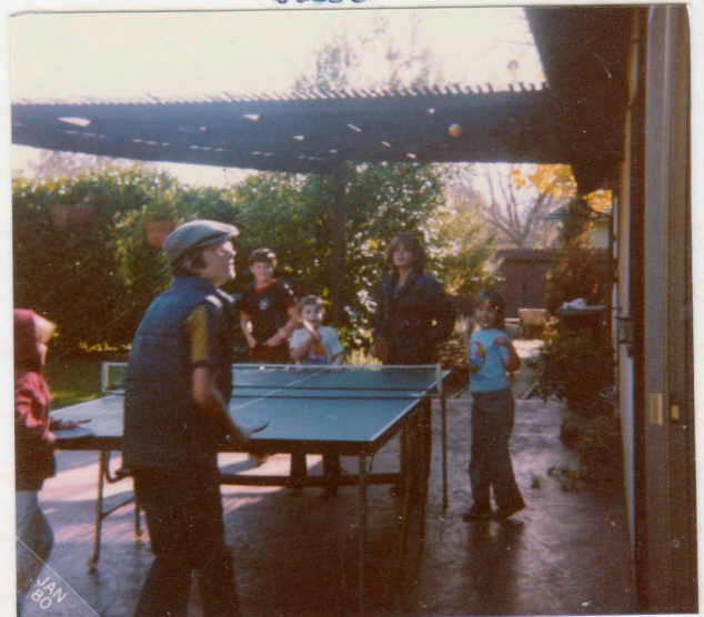
Kids on Patio