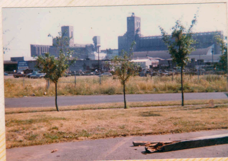
CARBONDALE PLANT, CANNERY & JUNKYARD