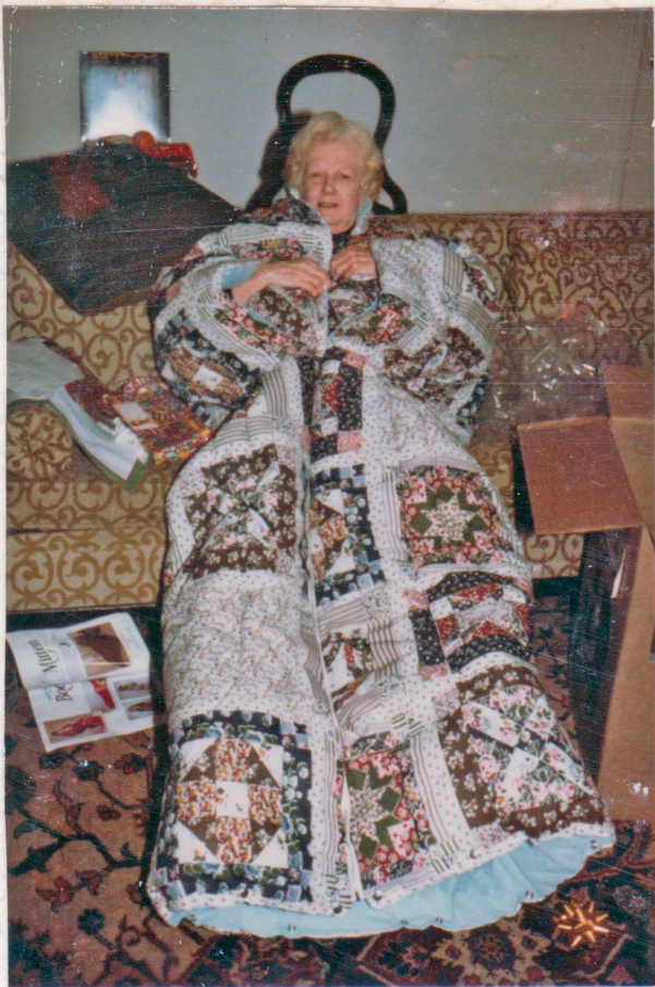
me + my Sangle-Bag a gift