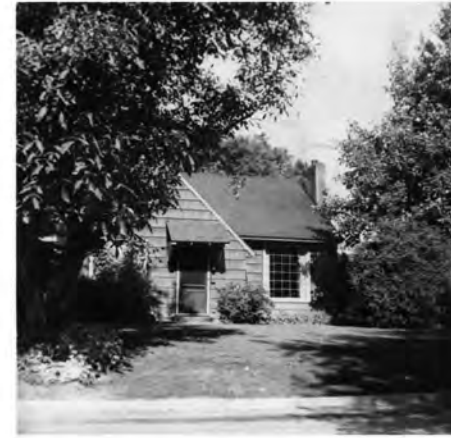
" 204 "