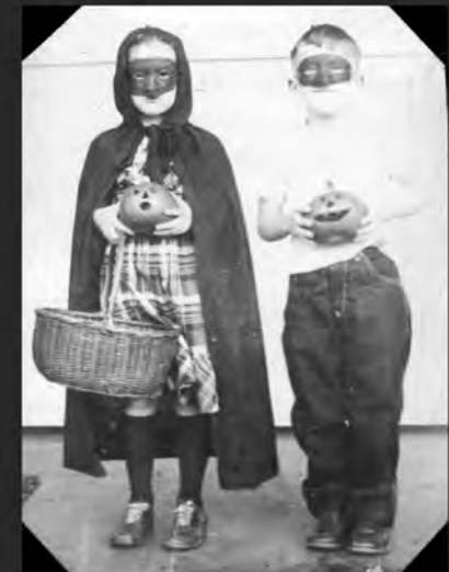
J + D. Halloween