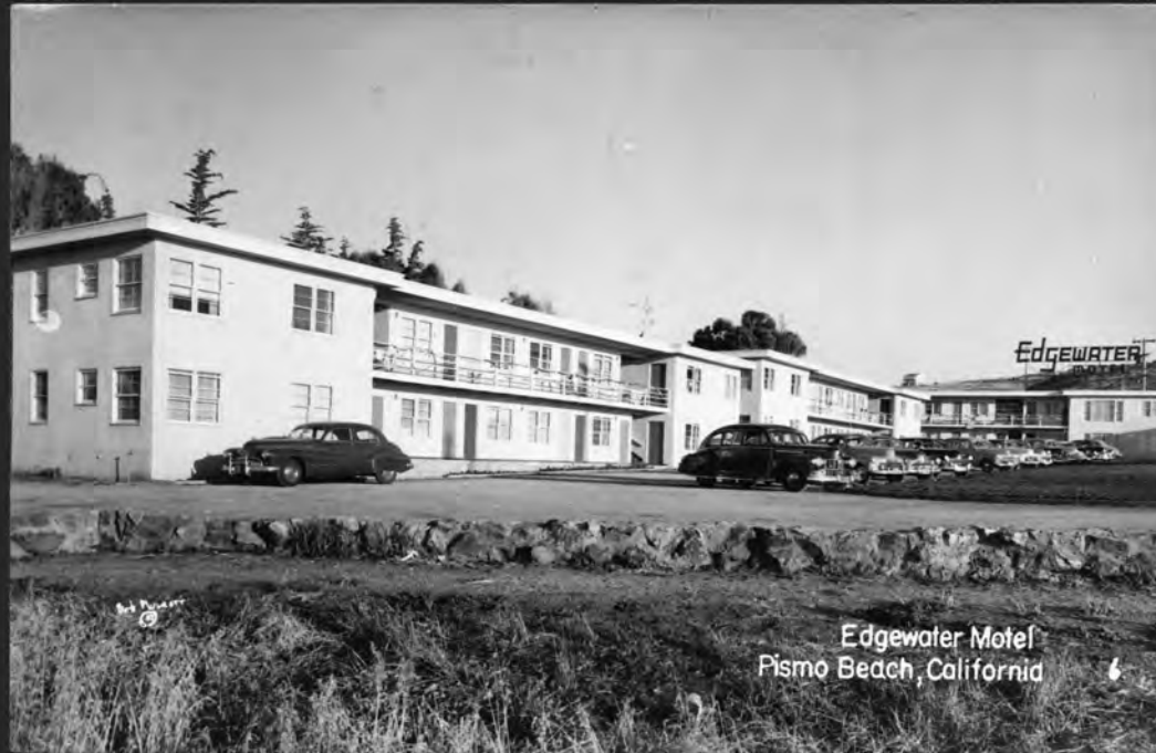
Edgewater Motel Pismo Beach, California