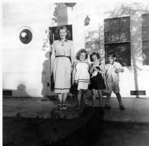
PORTLAND - ORE.