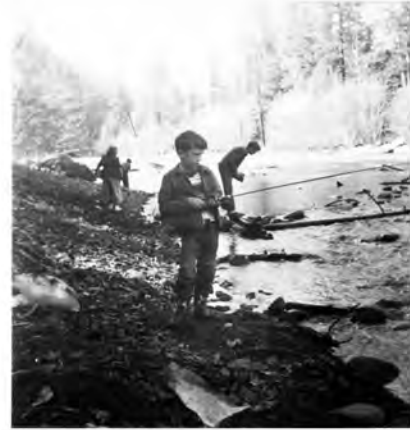
AT POWELL'S CABIN