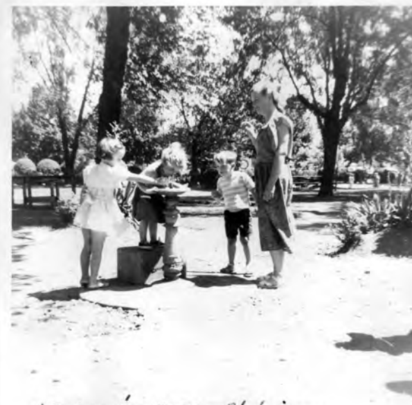
AT LIONS PARK - Yakima