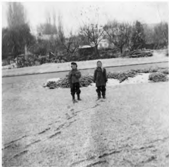
D + J