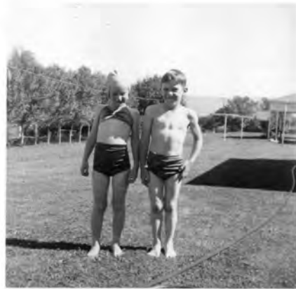
J. - D.