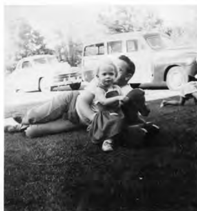
"MIMI" + BUD