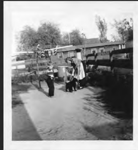
"Blackie" the dog