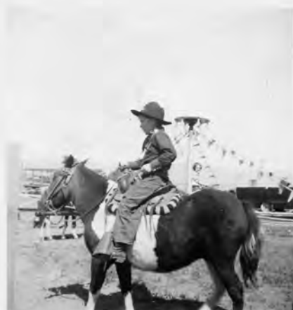
CARNIVAL - D.