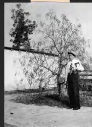
Ed's pepper tree