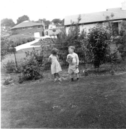
LIVESLEYS' — (back)