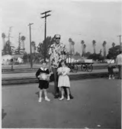
GLENDALE STATION JUNE 18