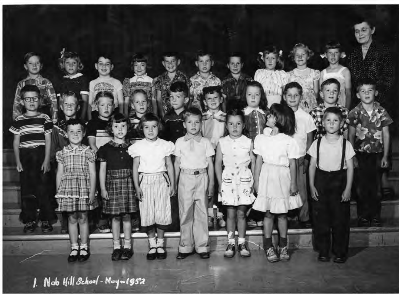
1. Nob Hill School - May - 1952