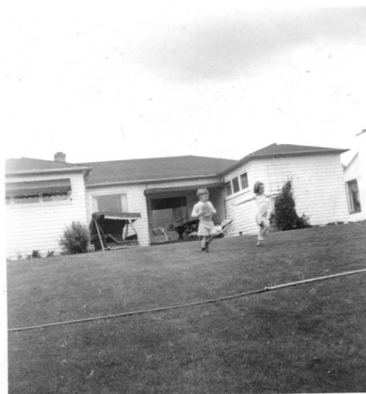
LIVESLEYS — (BACK)